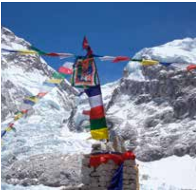
Puja honoring the mountain, 2014