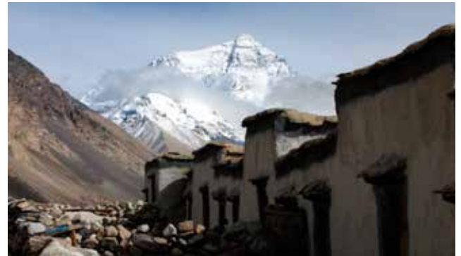
Rongbok Monastery in Tibet