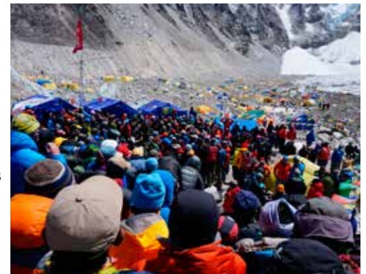
Meeting of Sherpas after 2014 accident