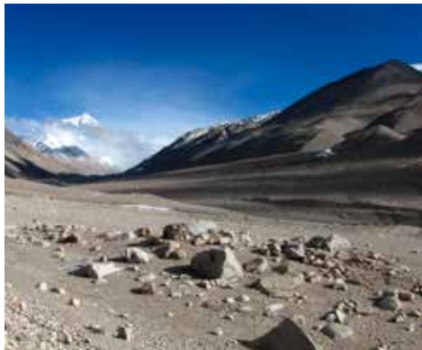
Approach to Everest Base Camp through Tibet