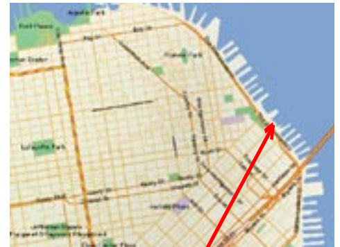
Sinbad's Pier 2 Restaurant is easy to find: JUST south of San Francisco's Ferry Building! Parking is available. BART access.

Please make your checks out to The Explorers Club, Northern California Chapter , and mail with this form to: