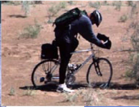
The Silk Road is not paved in all places.