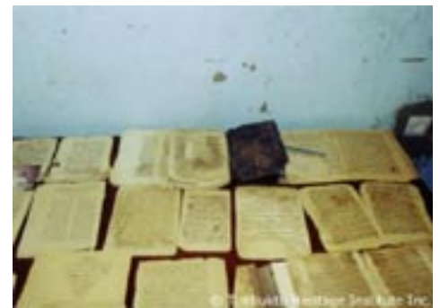
Examples of the hundreds of thousands of manuscripts which need attention.