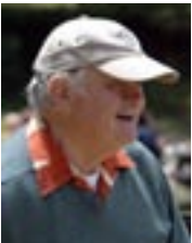
Diggles and Langan captured the mood of the day in photos that tell the tale of an event enjoyed by all who made the effort to attend. More photos can be found on our web site.